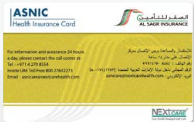
ID card in UAE & GCC ++ Countries (Bahrain, Kuwait, Qatar, Oman, Lebanon)